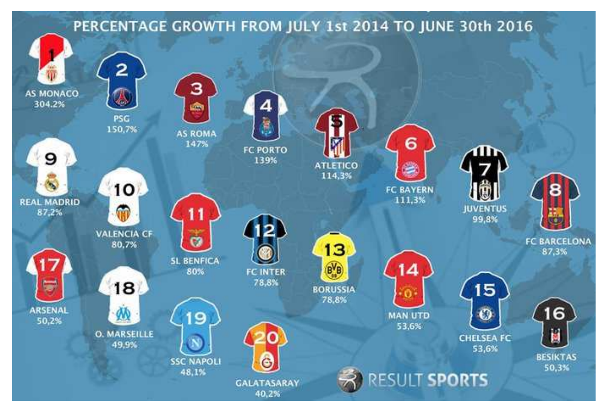
AS Monaco is top of the ranking carried out by the agency Result Sports

Its motto: to offer creative, innovative, high-quality content to give pleasure to fans, encourage their loyalty and bring them ever closer to the professional team and the club