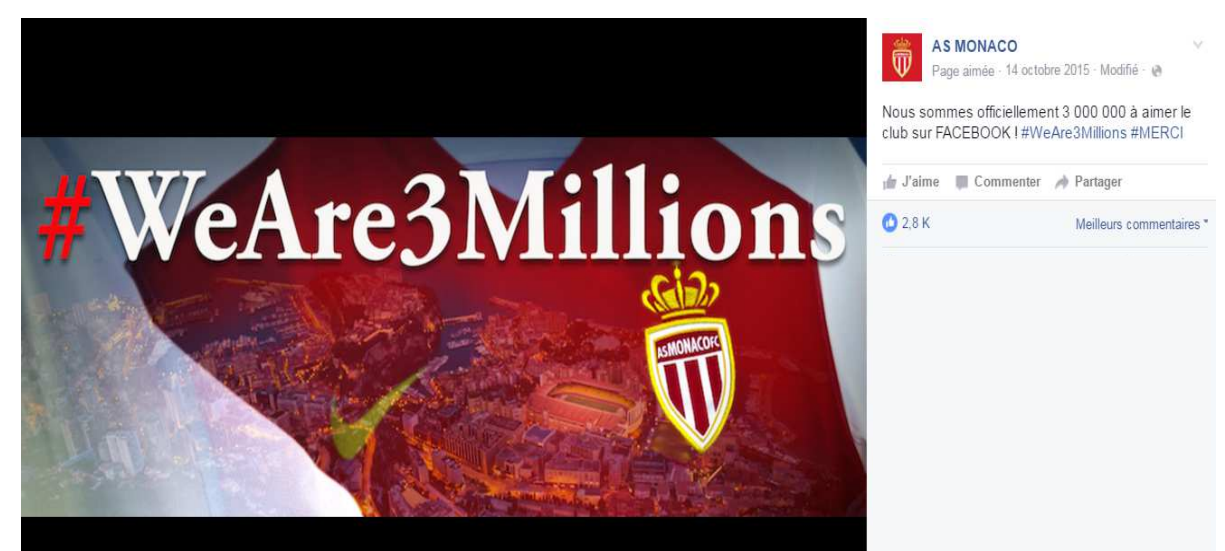
14 October 2015: AS Monaco reaches the milestone of 3M on FB

3.5% of sessions are from Monaco, 60% from France and 36.5% from the rest of the world (Colombia, the UK, the USA, Italy, Spain, etc.)